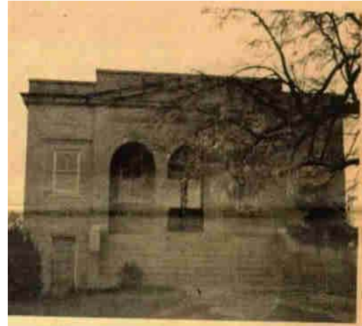
Fig. 3. Benbrook Methodist Church