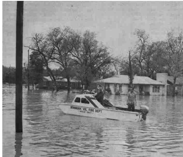
Figure 4. Benbrook Volunteers Assisting Fort Worth Flood Victims, 1949 .