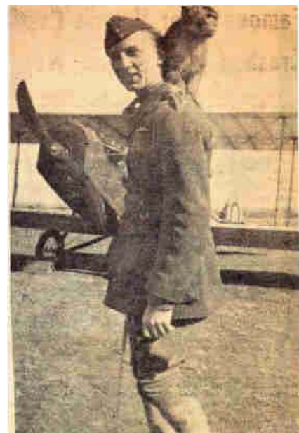
Figure 2. Vernon Castle

Early during World War I, General John J. "Blackjack" Pershing invited the Royal Canadian Flying Corps to establish its training fields in Texas because of its mild weather. 57 After looking at sites in Dallas, Fort Worth, Waco, Austin, Wichita Falls and Midland, three