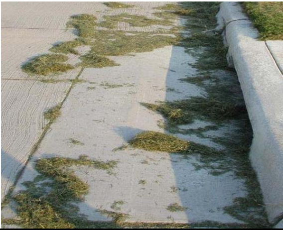
Yard waste in streets & storm drains leads to flooding & water quality problems.

The City of Benbrook's storm water quality regulations require that residents avoid discharging yard waste into the Municipal Separate Storm Sewer System (MS4). The MS4 is a system of conveyances owned and operated by the City and designed to collect or convey storm water. The system includes sidewalks, roads and drainage systems, municipal streets, catch basins, curbs, gutters, ditches, inlets, piped storm drains and other drainage structures.